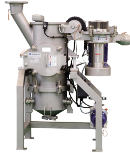
Fig.9 400TFG in open position