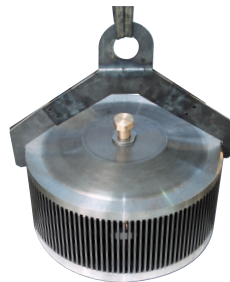
Fig.11 TSP classifying wheel