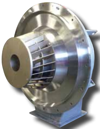
Classifier assembly for Mikro® E-ACM