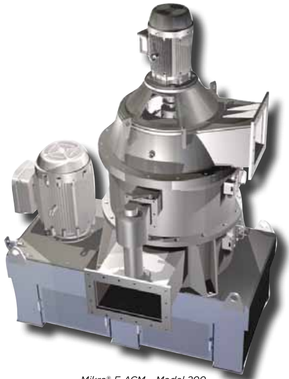
Mikro® E-ACM - Model 200